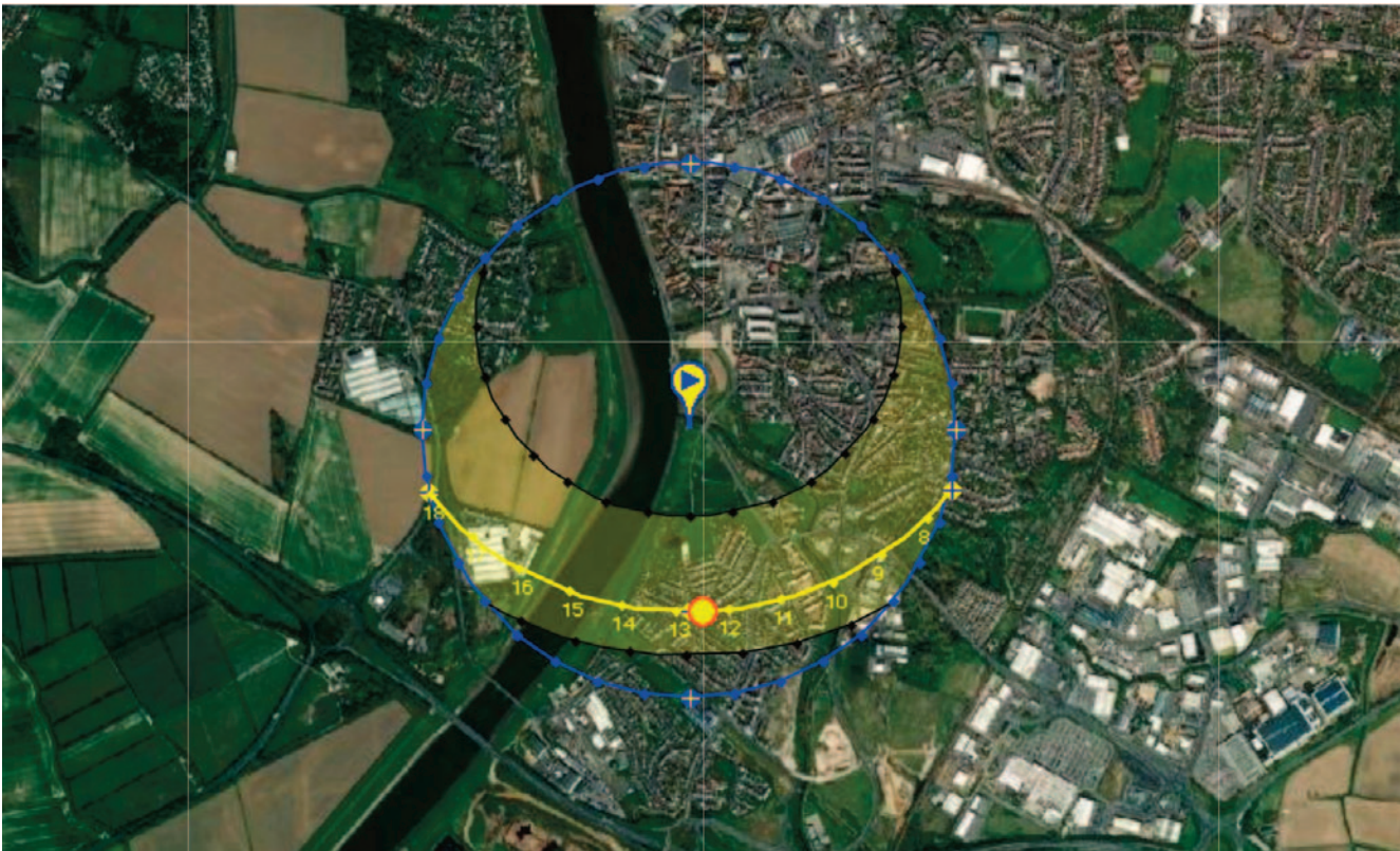
diagram showing the movement of the sun in the winter months in relation to the site for the artwork - the artwork is positioned so as to interact with low winter sun.

when the sun hits the inlaid colour panels the reflective element reveals the hidden word of the feathership. the word will be chosen through community engagement in kings lynn but kept secret and only revealed in the artwork.